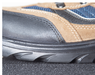
Thickness 13 mm